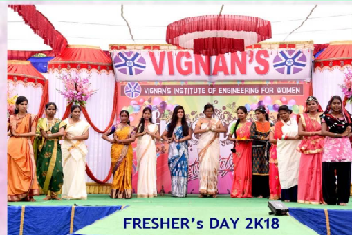
FRESHER's DAY 2K18

Workshop on "SCALE" Date: 26 th to 28 th July 2018.