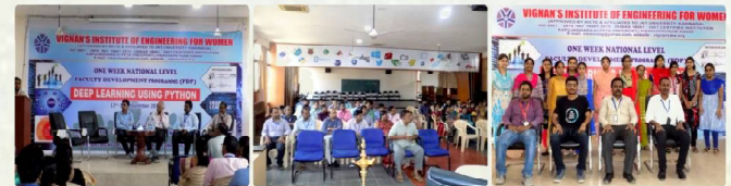
A One Week FDP organised by Dept. of CSE on Deep Learning using Python in association with Smart Bridge from 13/11/2017 to 19/11/2017