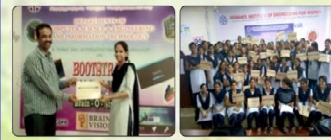
A Workshop on Bootstrap was organized by the Dept. of CSE for HETech students in association with Brain-O-Vision from 21/07/2017 to 23/07/2017.