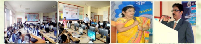
A Three Day Inter-Departmental workshop on “AP Cloud MEAN Stack and Cloud Developer” was organized by Department of Computer Science Engineering and Information Technology in Association with AP Cloud Team, Miracle Software Systems, Inc on 27 th – 29 th November 2017.

A one week Inter-Departmental Faculty Development Programme (FDP) on “Deep Learning Using Python” was organized by Department of Computer Science Engineering and Information Technology on 13 th – 18 th November 2017.