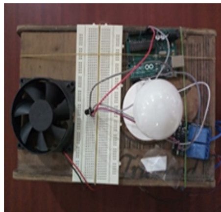
Home Automation using TV