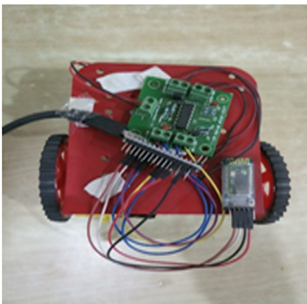
Voice Controlled Car