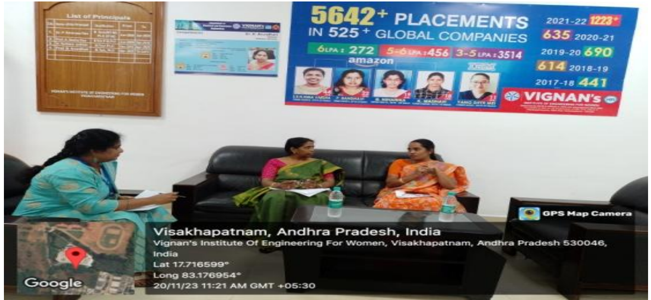
Discussion on “Water Conservation”, “Usage of LED Bulbs” Activities conducted