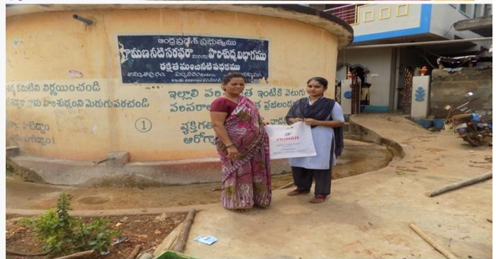
Awareness program on “No Plastic & Distribution of Jute bags” in the adopted villages