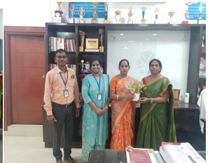
Inauguration of “Go-green & Waste Water Management” Activity