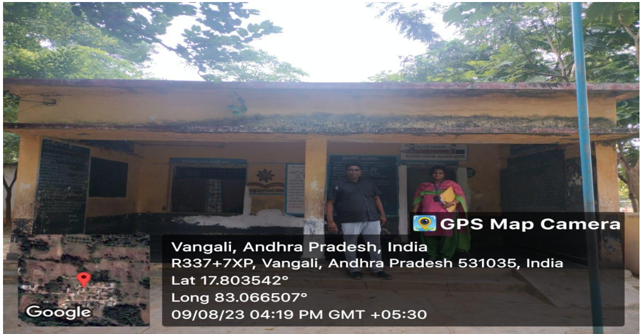
Sanctioned Project under “Water Resource management” for the Primary School, Aripaka.