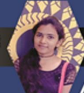
RVS RNS VAISHNAVI 15NM1A0593